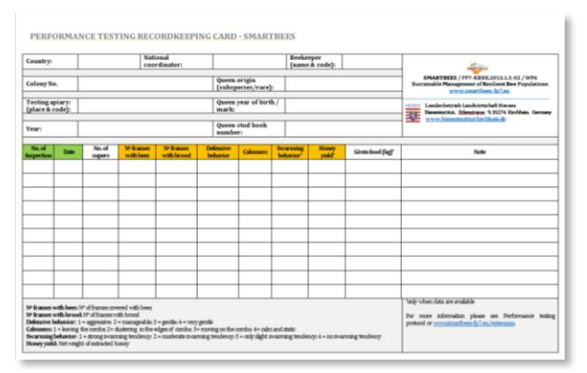
Figure 5 SMARTBEES recordkeeping card

Documentation of the applied management operations and records of the performance testing are essential activities in the breeding process (Fig. 5). Consistency and accuracy