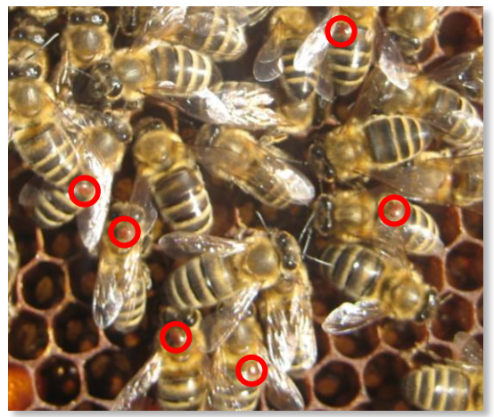
Figure 2 Infested honey bees

Identification of honey bee populations resistant to V. destructor is of particular interest for the SMARTBEES project. Thus, a specific approach should be used for monitoring and control of the mite in at least one full annual cycle. During the summer period the test colonies should be checked for the infestation of bees (Fig. 2) on a monthly basis in order to identify resistant colonies whose infestation levels remain below certain thresholds. Consequently, the identified test colonies will be wintered without therapeutic treatment against Varroa. The successfully overwintered colonies, which reach the next season in healthy condition, will preferentially be selected for the further breeding process.